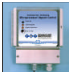
TWT-5C8-401 Deposit Controller