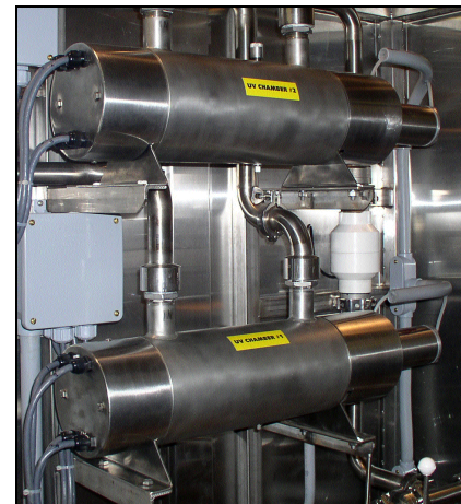
TWT Deposit Control & Quattra UV50 Integrated for High Volume Application

University test proves Triangularwave Technologies, Inc. (TWT®) Deposit Control System reduces the fouling effects caused by "hard water" on the quartz sleeve and UV lamp inside the disinfection/purification unit while maintaining the residual effects downstream chemically free.