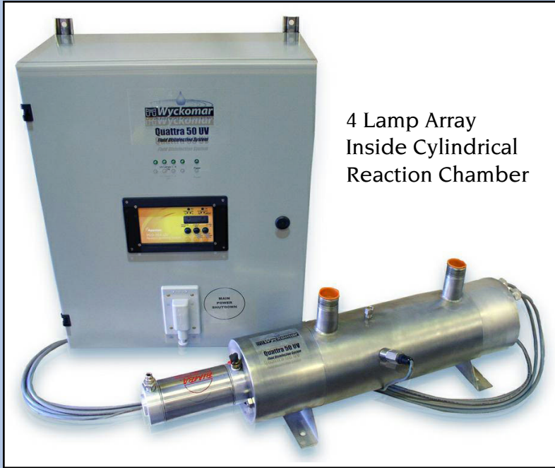
4 Lamp Array Inside Cylindrical Reaction Chamber

This ultraviolet disinfection/purification system is ideally suited for commercial/ industrial and marine effluent applications.